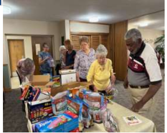
Volunteers make Snack Packs for the Valeo Mobile Access Partnership (MAP) Program