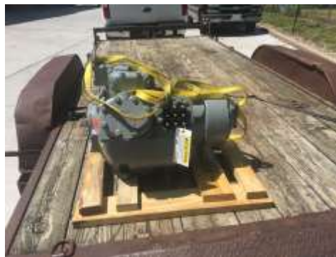
A.C. Repairs: Midwest Coating Inc. Crain