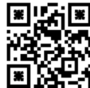
BIBLE STUDIES & GROUPS

BIBLE STUDIES & SMALL GROUPS – Do you want to learn more about the great Story of the Bible? Do you make to make friends with Jesus and other believers like you? Scan the QR code or visit the church website at www.wsbctopeka.org to join a Bible study at West Side Baptist Church. Classes are taught by gifted leaders and teachers for adults, beginners, and women.