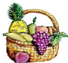
Remembering Others In Need

their years of service, and to help many with financial needs. This offering is important in that it gives all those who participate the opportunity to be thankful for those who have gone ahead and paved the way for new ministries, to be grateful for the lives they have touched as they have shared God's love. We will be taking this very special and meaningful offering on Sunday, December 11 th and the 18 th during the Sunday services. There will be special envelopes or you may just mark on your offering envelope how much you would like to designate toward the RMMO. Thank you for sharing your generosity with those who have given their years of service to the Lord.